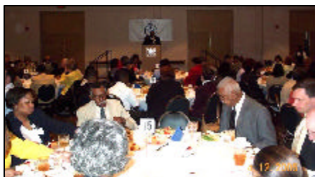
Over 170 people attended the Commission's Tenth Annual Fair Housing Luncheon Thank you for your support!